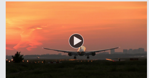
A HARD PILL TO SWALLOW