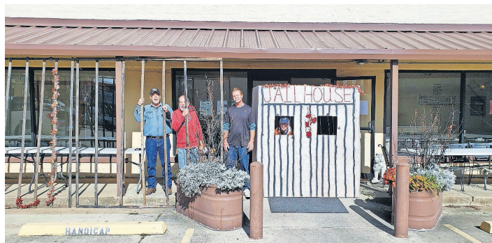
Members of the Outcast 4 Christ Recovery Ministry set up a jailhouse outside of WOW Church as part of a fundraiser for their Bikes 4 Christmas program for local children in need. The Outcasts along with women from Destiny Recovery Center volunteered to be "jailed" and then called friends and family to bail them out by donating to the event.

127th issue - No. 25 © Gannett Co., Inc. 2020 All Rights Reserved