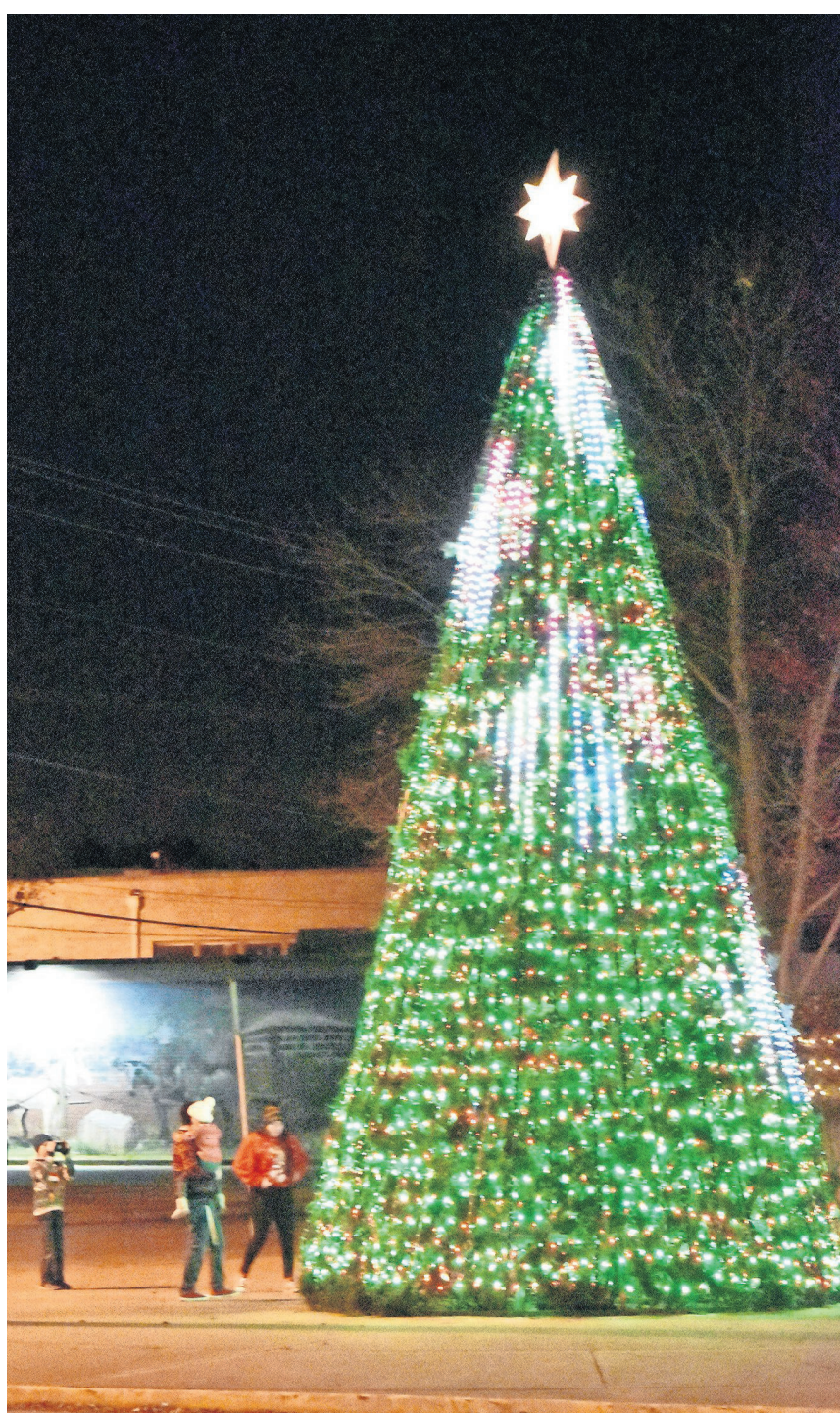
Families take photos of the Christmas tree lighting at Central Park on Tuesday.