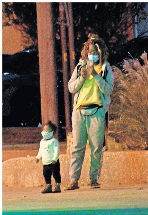
A young child looks in wonder at the Christmas tree lights in Central Park while a woman reviews photos on Tuesday.